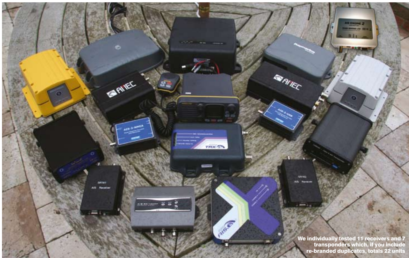
We individually tested 11 receivers and 7 transponders which, if you include re-branded duplicates, totals 22 units