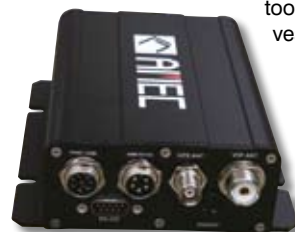
A range of connections is available

This receiver is just being launched in Europe with three variants. The entry level 101-E has NMEA input and output, accepting data from an external GPS and adding the AIS data to it for output. The 101 adds to this a PC interface (USB or RS232), and if USB is used for data then it can also be used for power. The 101-G model includes a GPS antenna, instead of accepting GPS data over the NMEA input. The unit comes with Amec's AIS Viewer software, which is a good tool for tracking vessels.