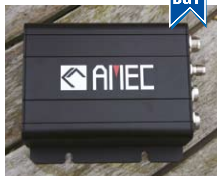
Amec's compact, rugged Cypho receiver

This receiver is just being launched in Europe with three variants. The entry level 101-E has NMEA input and output, accepting data from an external GPS and adding the AIS data to it for output. The 101 adds to this a PC interface (USB or RS232), and if USB is used for data then it can also be used for power. The 101-G model includes a GPS antenna, instead of accepting GPS data over the NMEA input. The unit comes with Amec's AIS Viewer software, which is a good tool for tracking vessels.