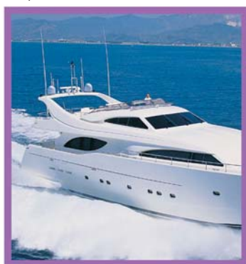
414 KB JPEG image