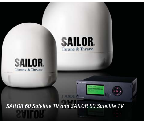
SAILOR 60 Satellite TV and SAILOR 90 Satellite TV

SAILOR Satellite TV systems are the result of extensive development of an existing product to create the best system on the market.